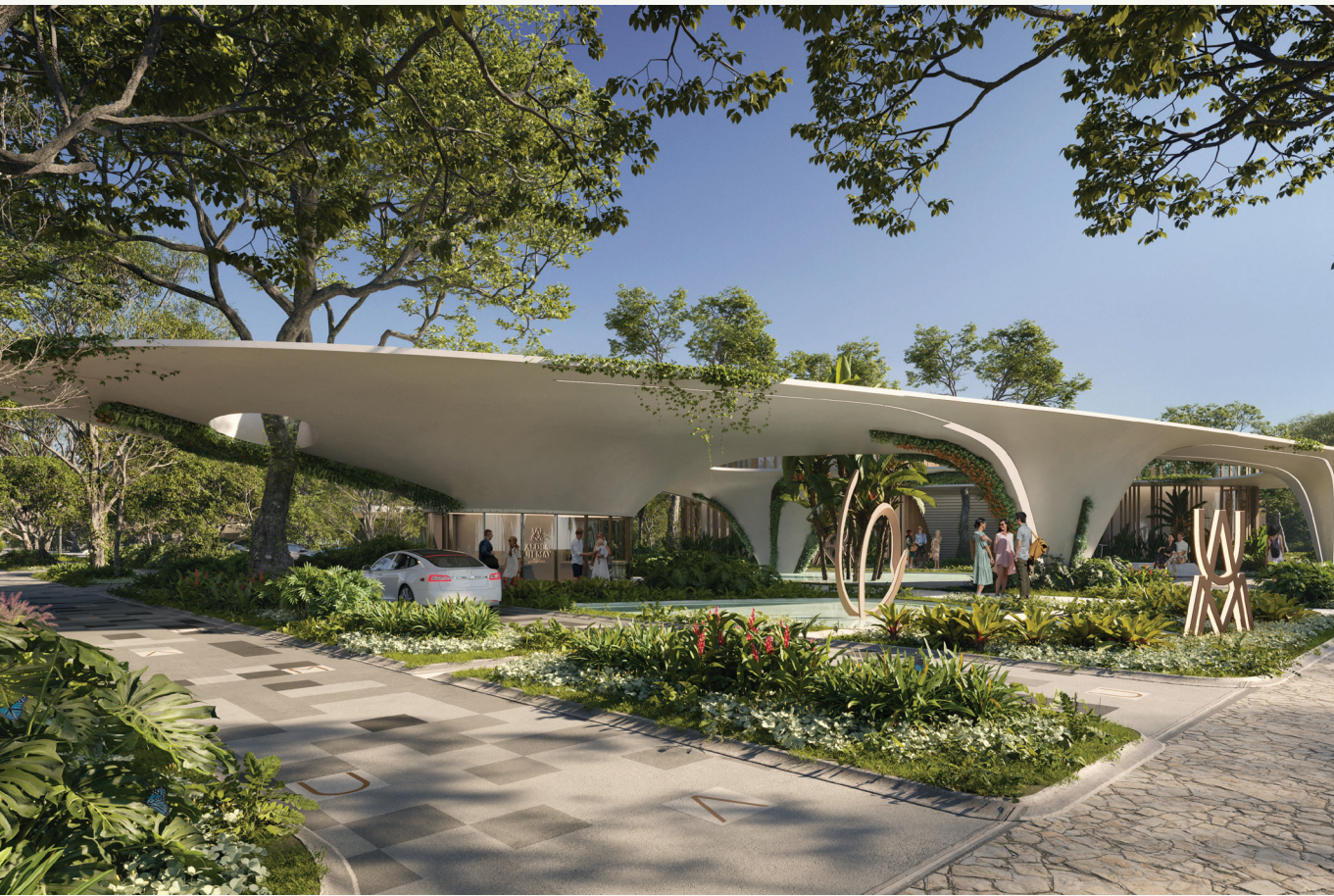
Main Entry Aldea Uh May