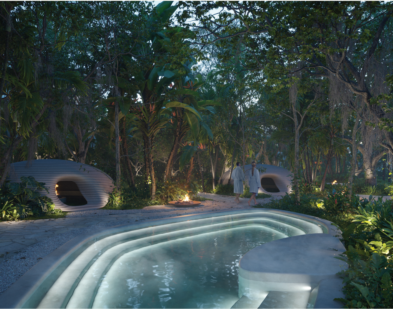
Secondary Amenity / 3D printed Temazcales