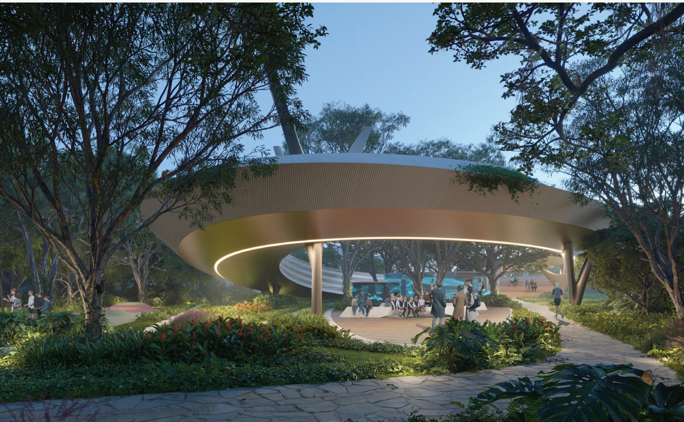
Secondary amenity / Amphitheater